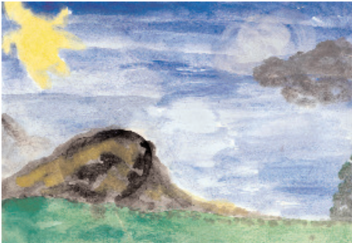
Lottie's watercolour entry